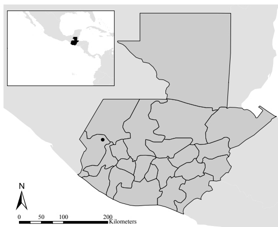
Figure 1: Location of the study area in Guatemala

The Marlin gold and silver mine is located in south-west Guatemala, in the Northern part of the San Marcos department (Figure 1). It is both an open pit and underground mine, which uses a cyanide tank leaching process to extract gold and silver (MEG, 2003). After finalization and approval by the Guatemala Government of the social and environmental impact assessment S&EIA(MEG, 2003) the mining site was developed in 2004 and operations were started in 2005. The mine site was developed by Montana Exploradora de Guatemala, S.A., with support of the International Finance Corporation (World Bank). Montana Exploradora is a daughter company of Glamis Gold, which was acquired in 2006 by the Canadian Goldcorp company. The mine is situated in a mountainous area at an altitude of 2000 m, in a semi-arid mountaineous climate with a distinct rainy sea-